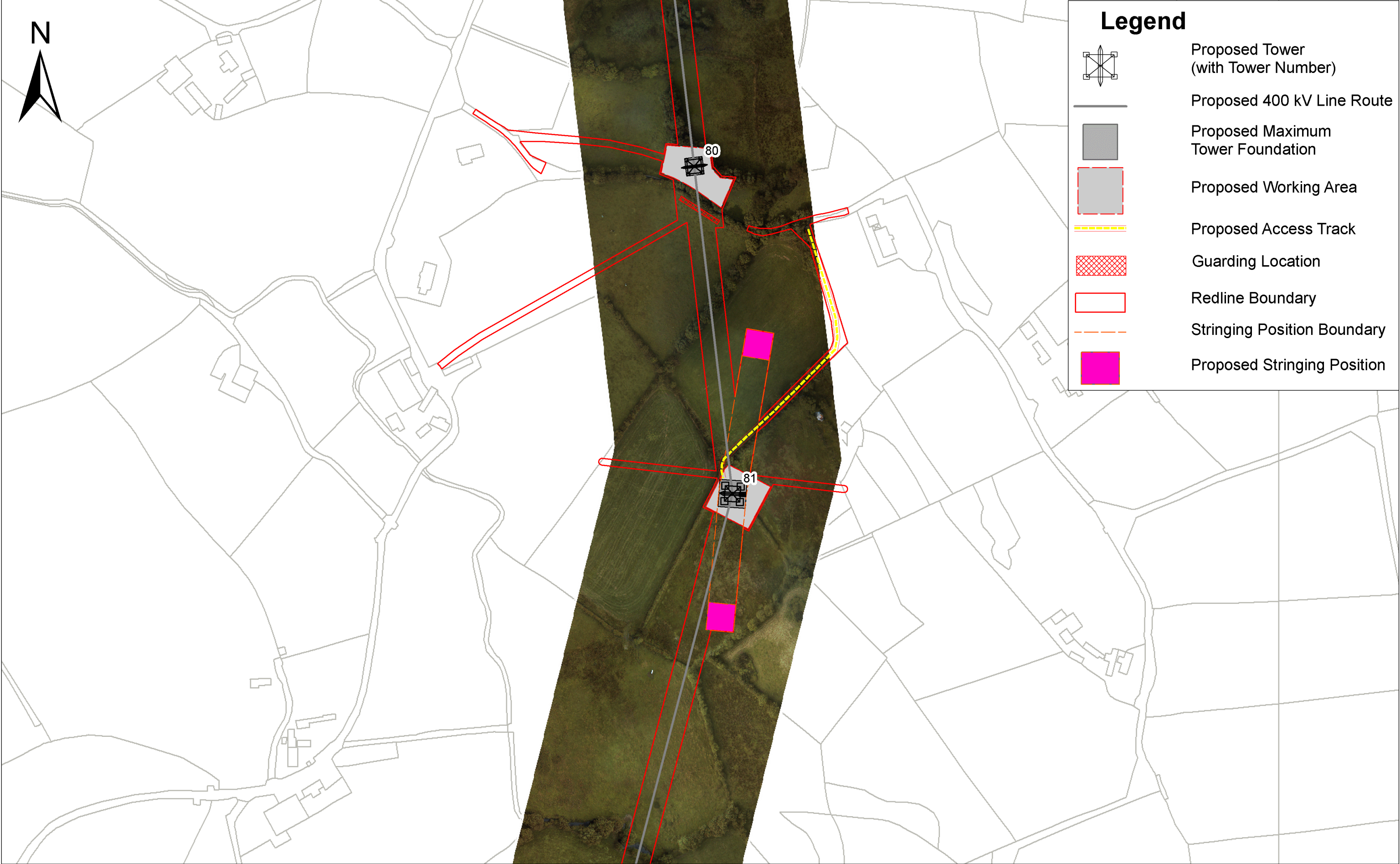
View 1: 1/2,500